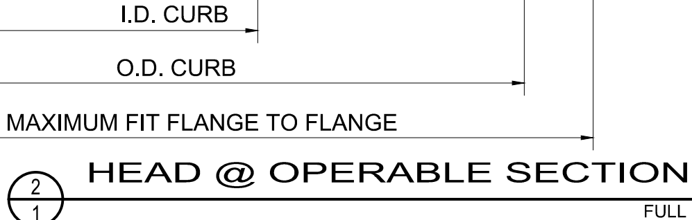
HEAD @ OPERABLE SECTION